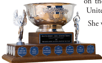
The Shane Corson-Greg Johnston Trophy

She was excited to represent her country at the highest level.